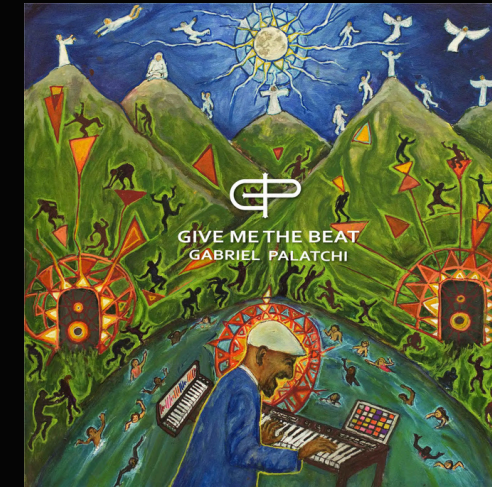
GIVE ME THE BEAT Canada 2024

His album TRIVOLUTION won the Gold Medal in both the Composer and Album categories, placed in the Top Ten of the 2016 Global Music Awards, and was featured in Billboard Magazine, among various other prestigious recognitions.