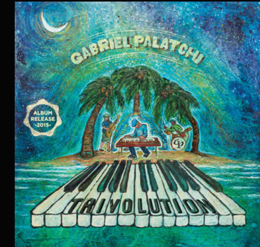
TRIVOLUTION Mexico City 2015