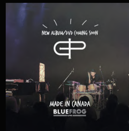
MADE IN CANADA Canada 2017