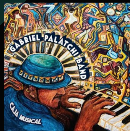
CAJA MUSICAL Buenos Aires 2015