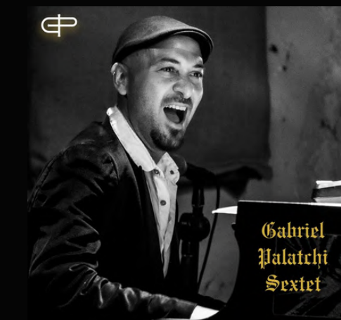
SEXTET - LIVE Tel Aviv 2023